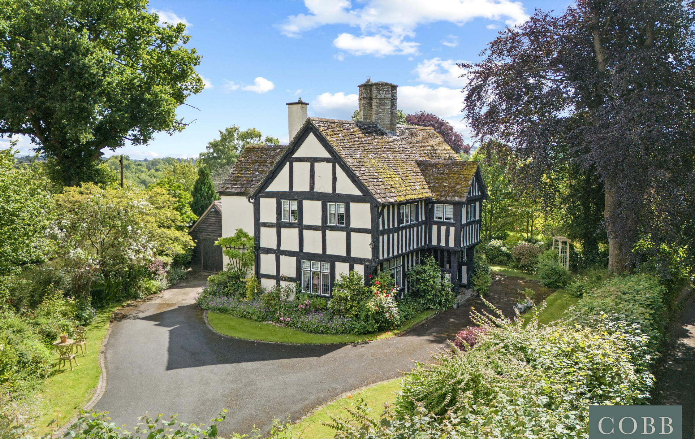
The Old House, 3, Church Road, Kington, HR5 3AG Price £450,000